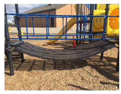
Bridge is breaking/ platform is bent